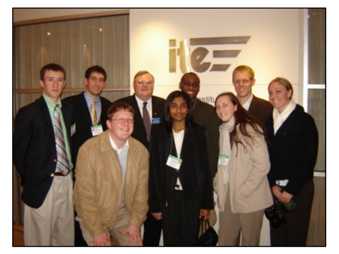
Clemson Student Chapter at ITE Headquarters in Washington, DC