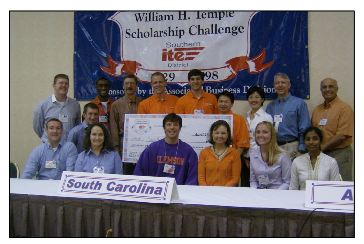
Clemson Student Chapter and Alumni after winning the 2007 Traffic Bowl Competition at the Southern District Meeting in Knoxville.